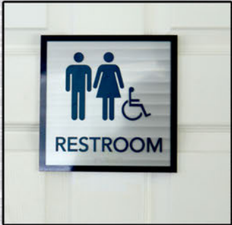
1/2" ALUMINUM PANEL with ROUTED COPY MOUNTED FLUSH TO CABINET PAINTED TO MATCH PMS 2956C (BLUE) (WHITE COPY IS CABINET BEHIND PANEL)